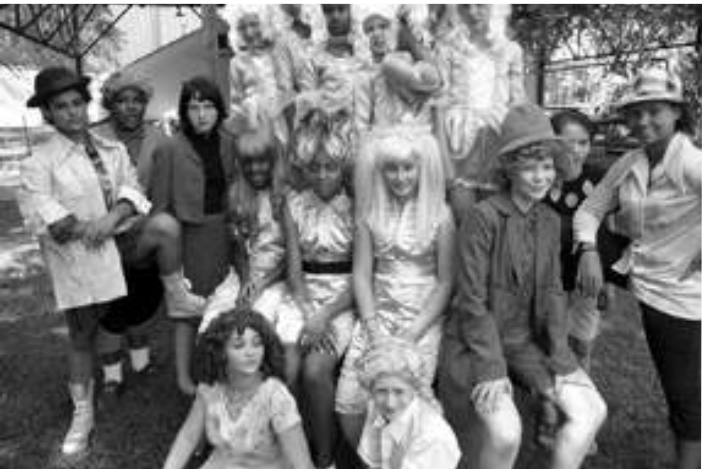
The cast of Mo's Night at the Opera, performed at the Antioch Amphitheatre last July

their appreciation for youth arts making and 96% said YSKP makes our community more liveable.