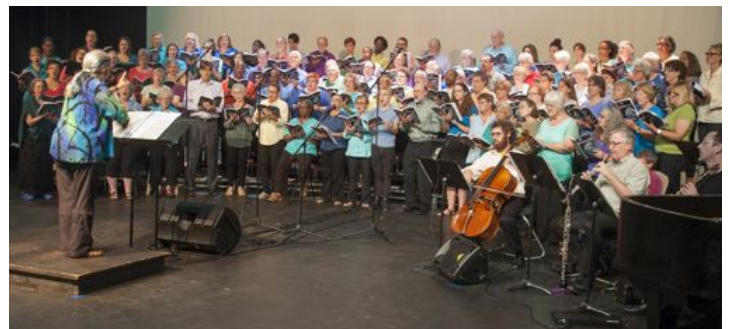
World House Choir Celebrates the Kings